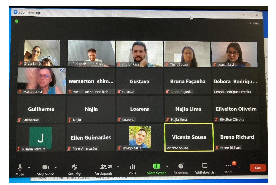
Figure 6. Students during the virtual course "Introduction to Ecological Restoration for the Recovery of Degraded Areas", organized by UFPA and BRC.

The course was a success. Many of the students participated in the final evaluation of the course and the vast majority highlighted the importance of the learning obtained, and submitted excellent course evaluations, as well as great suggestions for improvement.