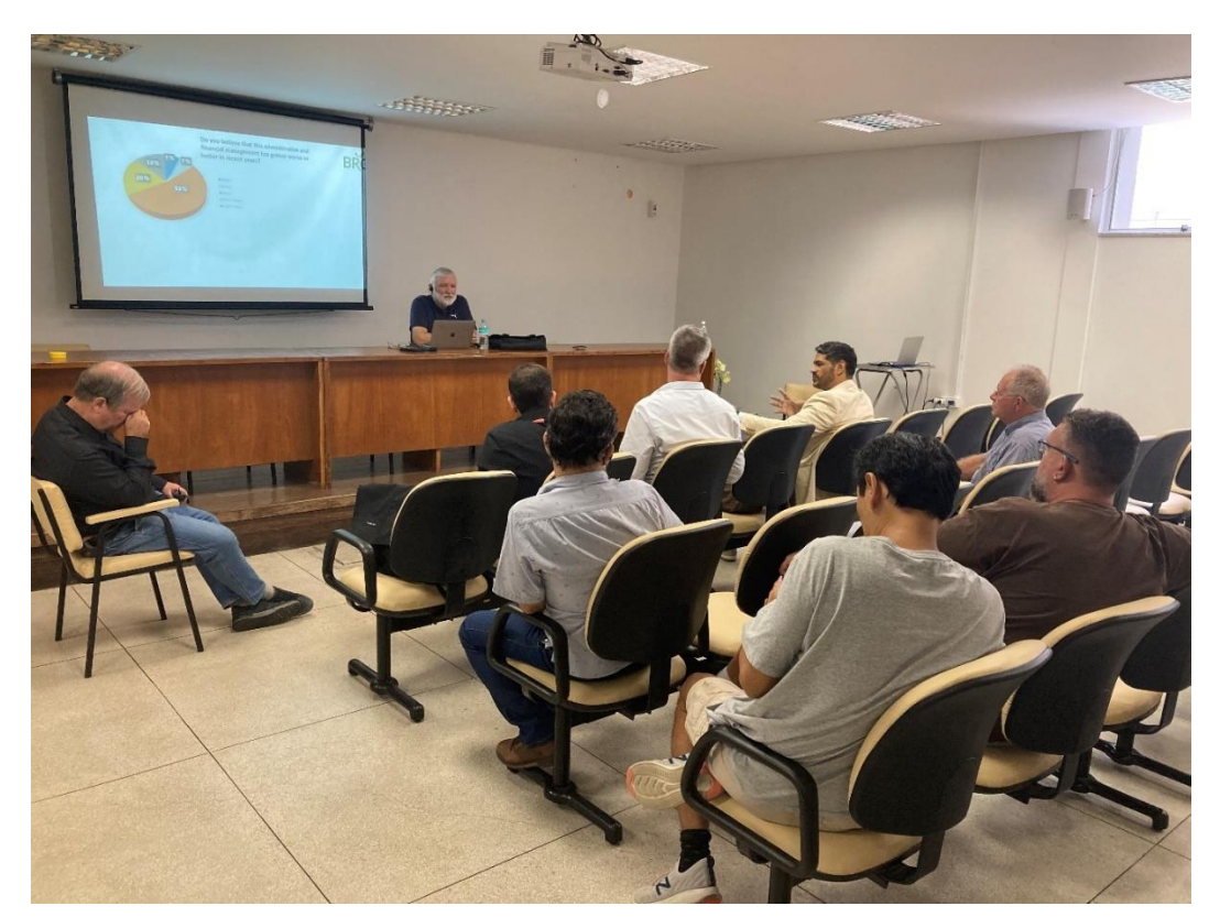
Figure 1. BRC Scientific Committee members and observers during the face-to-face meeting, in September 2022, at UFPA (Belém – PA).