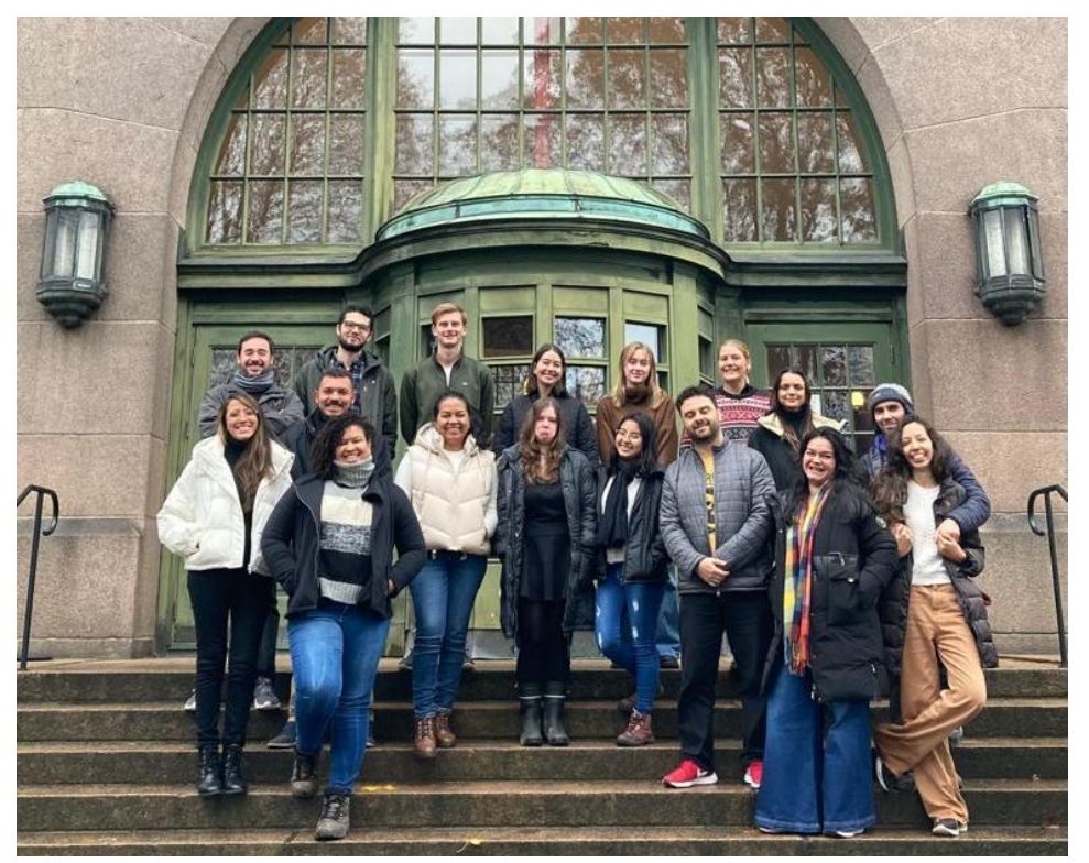
Figure 5: Students and professors of the field course at the Natural History Museum, Oslo (Photo: Rafael Assis).

Figure 4: The 2022's edition of the Field Course in Tropical Ecology and Biodiversity. Top: Students and professors at the field station, in Caxiuanã National Forest (Brazilian Amazon). Bottom: Visit at Hydro Paragominas (Photo: Rafael Assis).