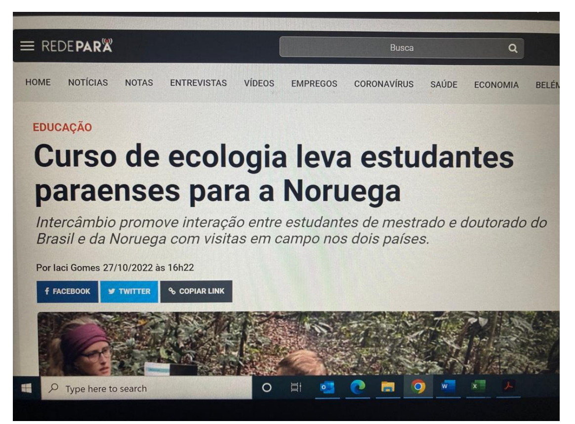
Figure 11. Pará's local newspaper highlighting the BRC field course in Tropical Ecology and Biodiversity for Brazilian and Norwegian students.

To summarize, the partnership between the BRC secretariat and Hydro's communication team has been active in producing material for dissemination for a broader audience. There is a tendency that the format to be used for this type of dissemination will be mainly via social media. We expect that much more material be produced in the near future, highlighting even more the achievements of the consortium.