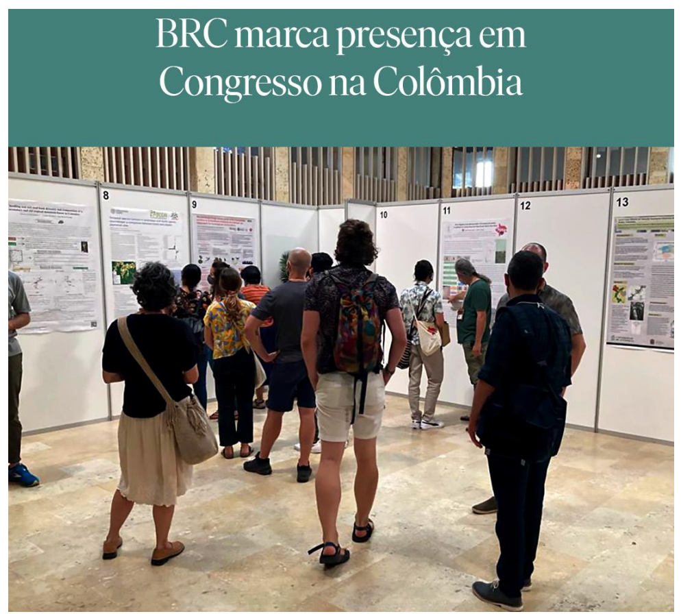
Figure 12. "BRC is represented in a Conference in Colombia" says the text in Portuguese. This material was disseminated on social media (Instagram) by Hydro's communication team. The material was produced in collaboration with the BRC secretariat (Image: Instagram – account "hydronobrasil").