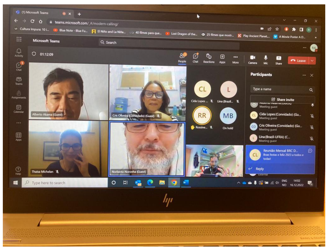
Figure 3. Attendees during the BRC monthly meeting, edition of December 2022.

These meeting have been of major importance to discuss all sort of topics relevant to the consortium, and approximate members of the BRC of the secretariat and Hydro. Also, it has been a great opportunity get people from FADESP and other partners of the consortium involved. We thank you for all those that attended the meetings and that contributed for the discussions.