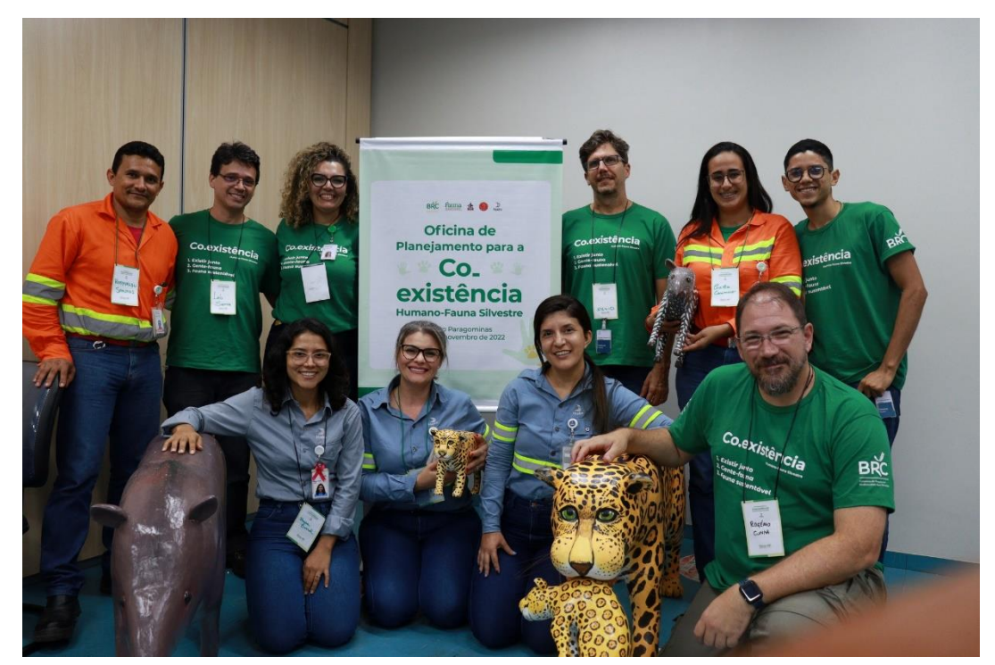
Figure 7. Researcher members of the BRC and staff from Hydro who organized and/or attended the workshop on Coexistence Human-Carnivores

The organizers of the event had the full support of the BRC and Hydro, which also recognize the importance of efforts like these to guarantee the conservation of crucial species for the Amazonian ecosystems, as well the welfare of the human populations that live in eventual contact with those animals.