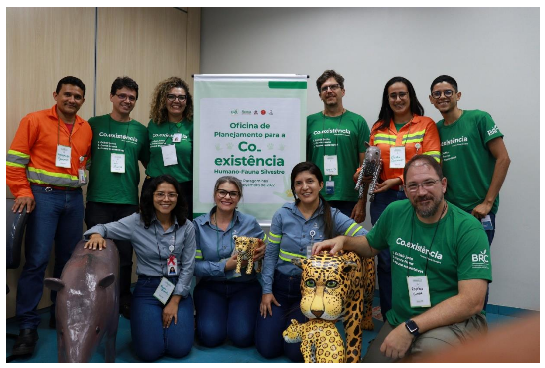
BRC back to face-to-face activities after two years of pandemic. Above: The 2022's edition of the Tropical Ecology course Between Brazil and Norway. Below: Researchers members of the BRC and staff from Hydro who organized and/or attended the workshop on Coexistence Human-Carnivores.